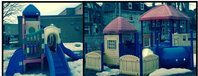
Recess will be even more fun and active with these additions

You can help provide our children with a safe, fun playground environment to encourage healthy, active lifestyles. And you don't need to feel guilty about not purchasing a pound of fudge or signing up for a magazine you will never read. The benefit you receive from a gift to the Wildcat campaign is unique: it's the pride in knowing your gift will help our kids, right here in the Welborne Community. Our goal is to help everyone share in the Wildcat spirit by supporting the healthy learning and well-being of all of our children.